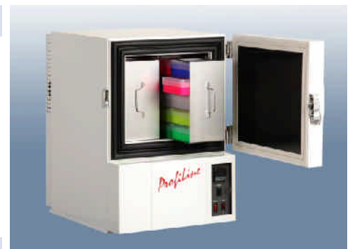
ProfiLine Pegasus PLPE 0486 (With accessories Inventory Systems. See sep. brochure.)