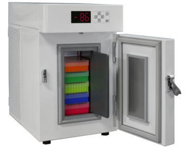
ProfiLine Pegasus PLPE 0186EWN (With accessories Inventory Systems. See sep. brochure.)