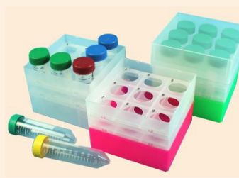
Plastic boxes made of Polypropylene