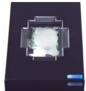
Scanner without Cryoprotection™