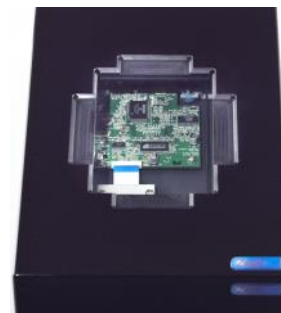
Scanner with Cryoprotection™